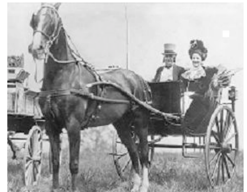
Original Robinson Riding and Driving Party guests and transportation